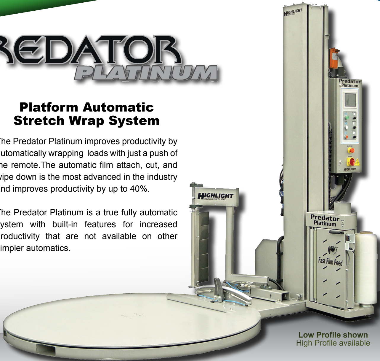
Low Profile shown High Profile available

The Predator Platinum is a true fully automatic system with built-in features for increased productivity that are not available on other simpler automatics.