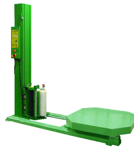
Photo eye and top and bottom wrap counters increase productivity and efficiency.