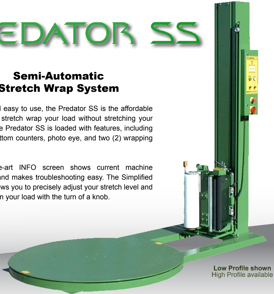
Low Profile shown High Profile available

State-of-the-art INFO screen shows current machine operation and makes troubleshooting easy. The Simplified Stretch allows you to precisely adjust your stretch level and film force on your load with the turn of a knob.