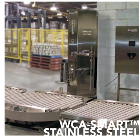
WCA-SMART™ STAINLESS STEEL