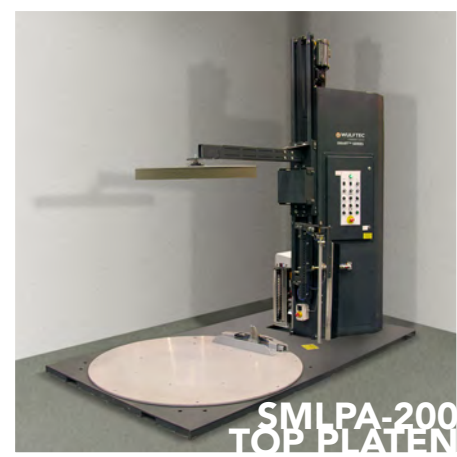
SMLPA-200 TOP PLATEN