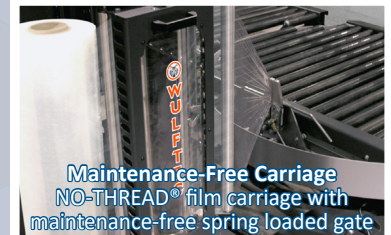
Maintenance-Free Carriage NO-THREAD® film carriage with maintenance-free spring loaded gate