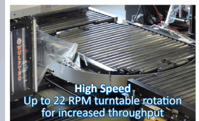
High Speed Up to 22 RPM turntable rotation for increased throughput

Equip one of the carriages with pneumatic roping or banding to increase load containment with a minimum number of rotations; Increased efficiency. Also secure the top and bottom portion of the load during the first rotation to improve load stability.