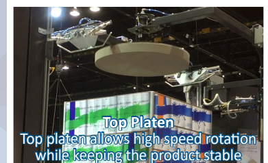
Top Platen Top platen allows high speed rotation while keeping the product stable