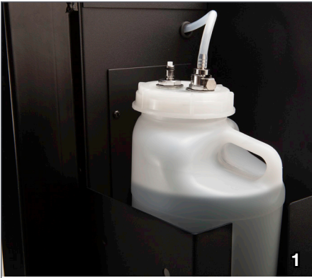
1) Large capacity ink bottle eliminates the constant changing of ink cartridges or containers.