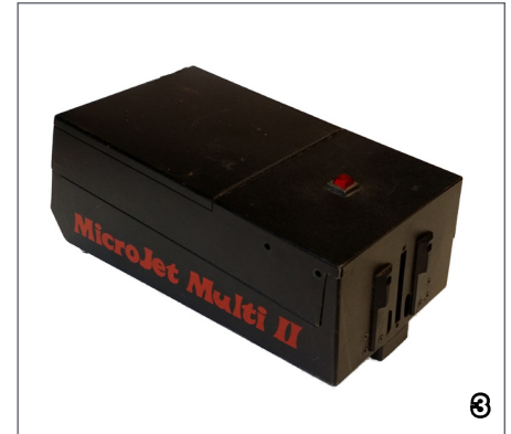
3) The Titan is compatible with the Little David Microjet®.