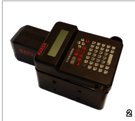
2) The Titan is compatible with the Marsh Unicorn®.